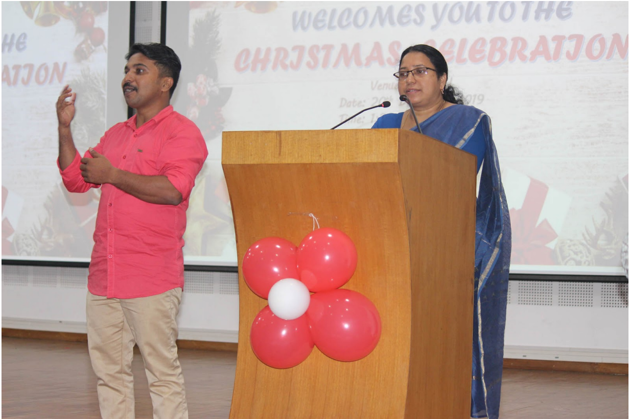
Christmas Celebration 2019