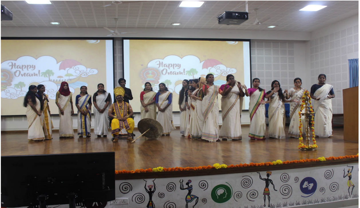
Onam 2019 Image 1