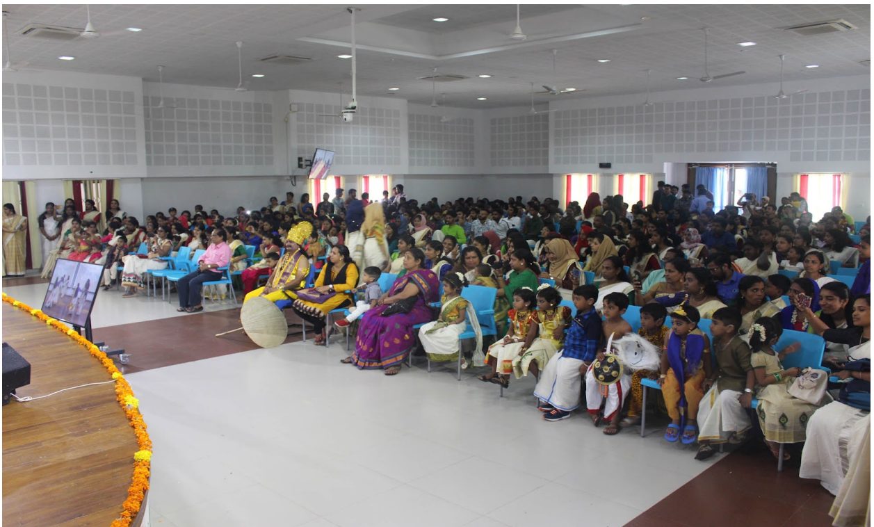
Onam 2019 Image 2