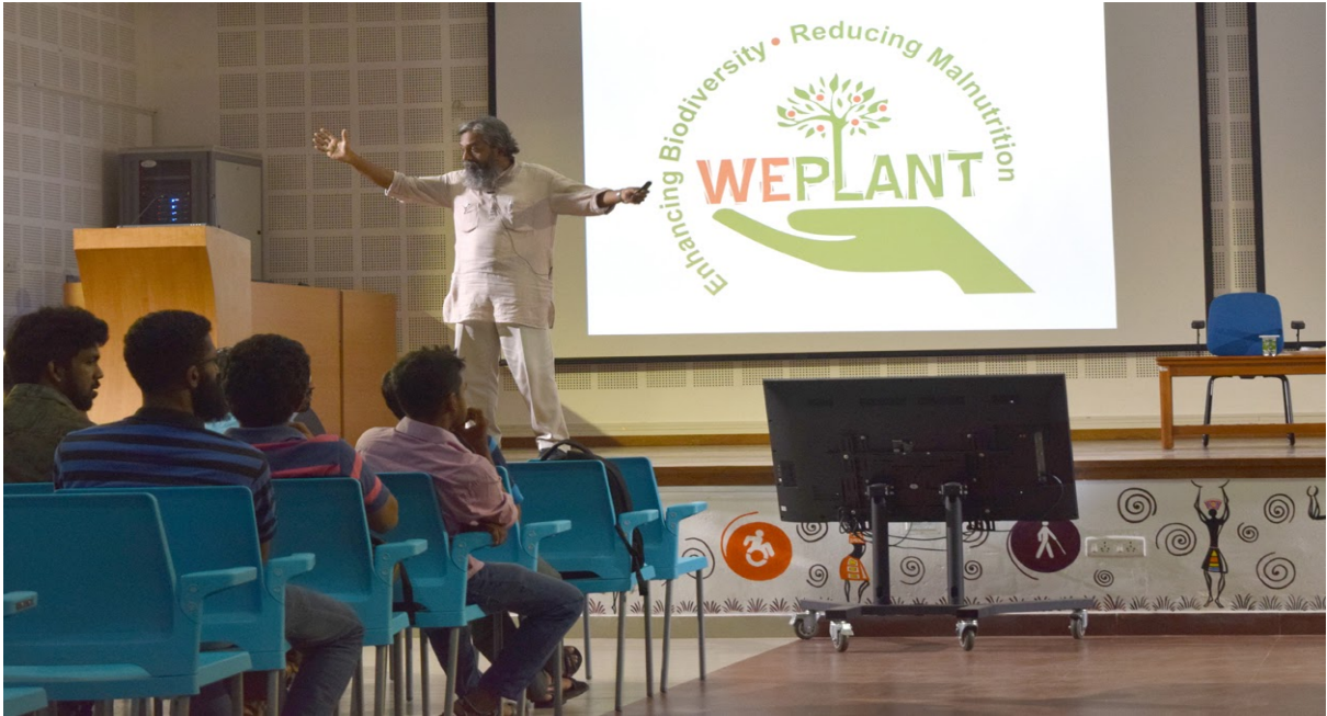
Talk on How to Save Seeds Image 1