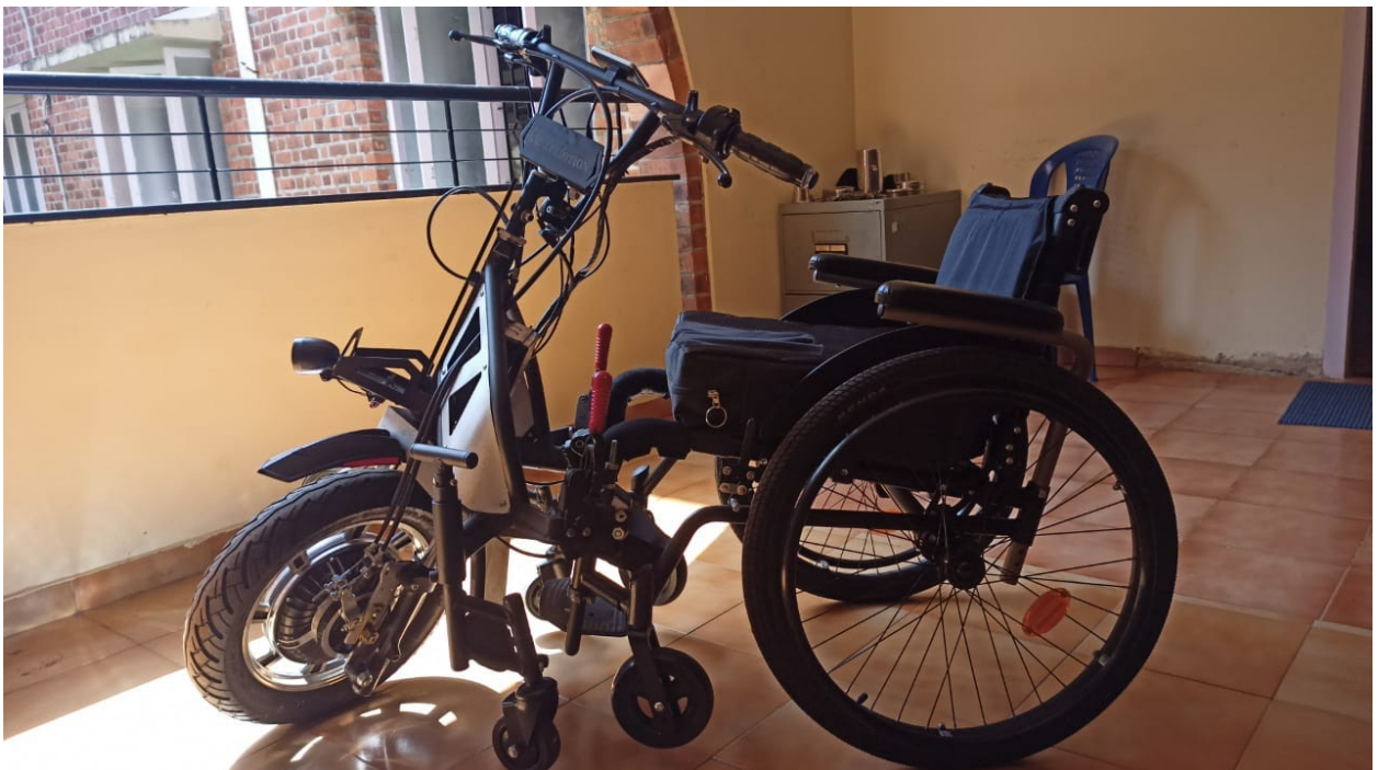
Electric Wheel Chair 2