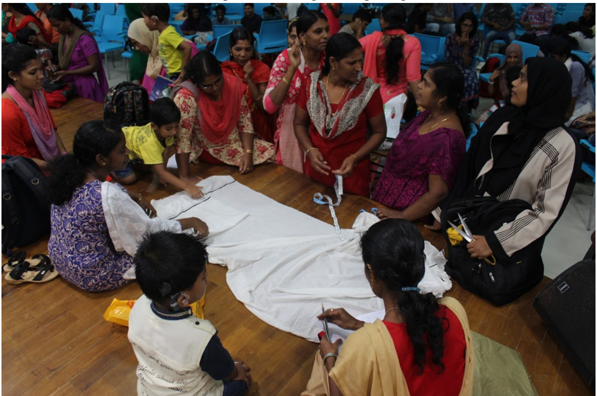
Workshop on Cloth-bag Making Image 2