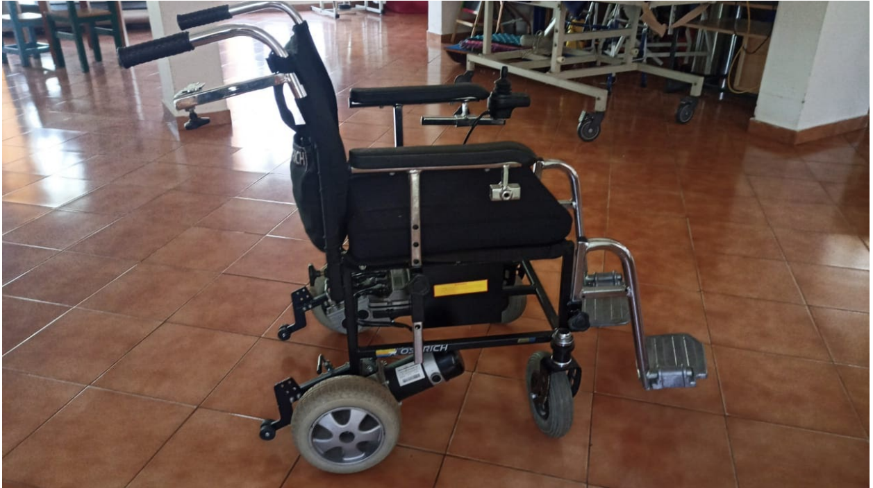
Electric Wheel Chair 1

There are electric wheelchairs available to be used inside the campus by clients with disabilities and ailments.