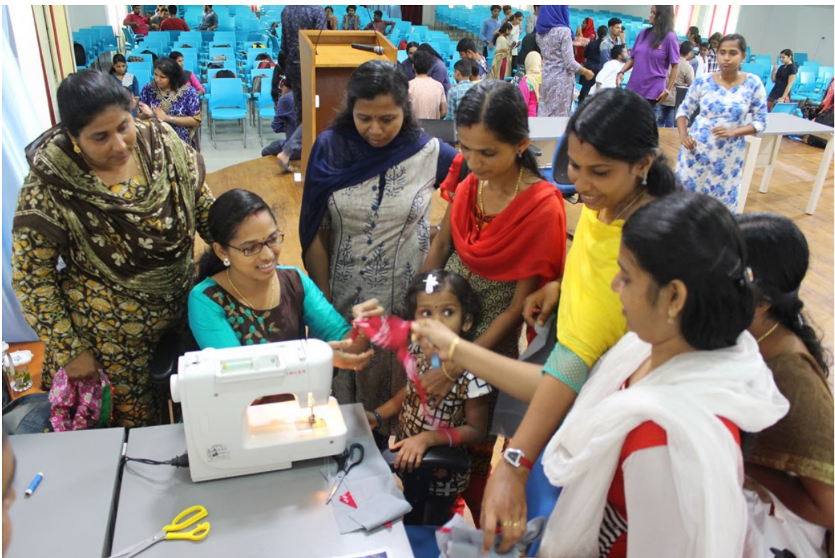
Workshop on Cloth-bag Making Image 4