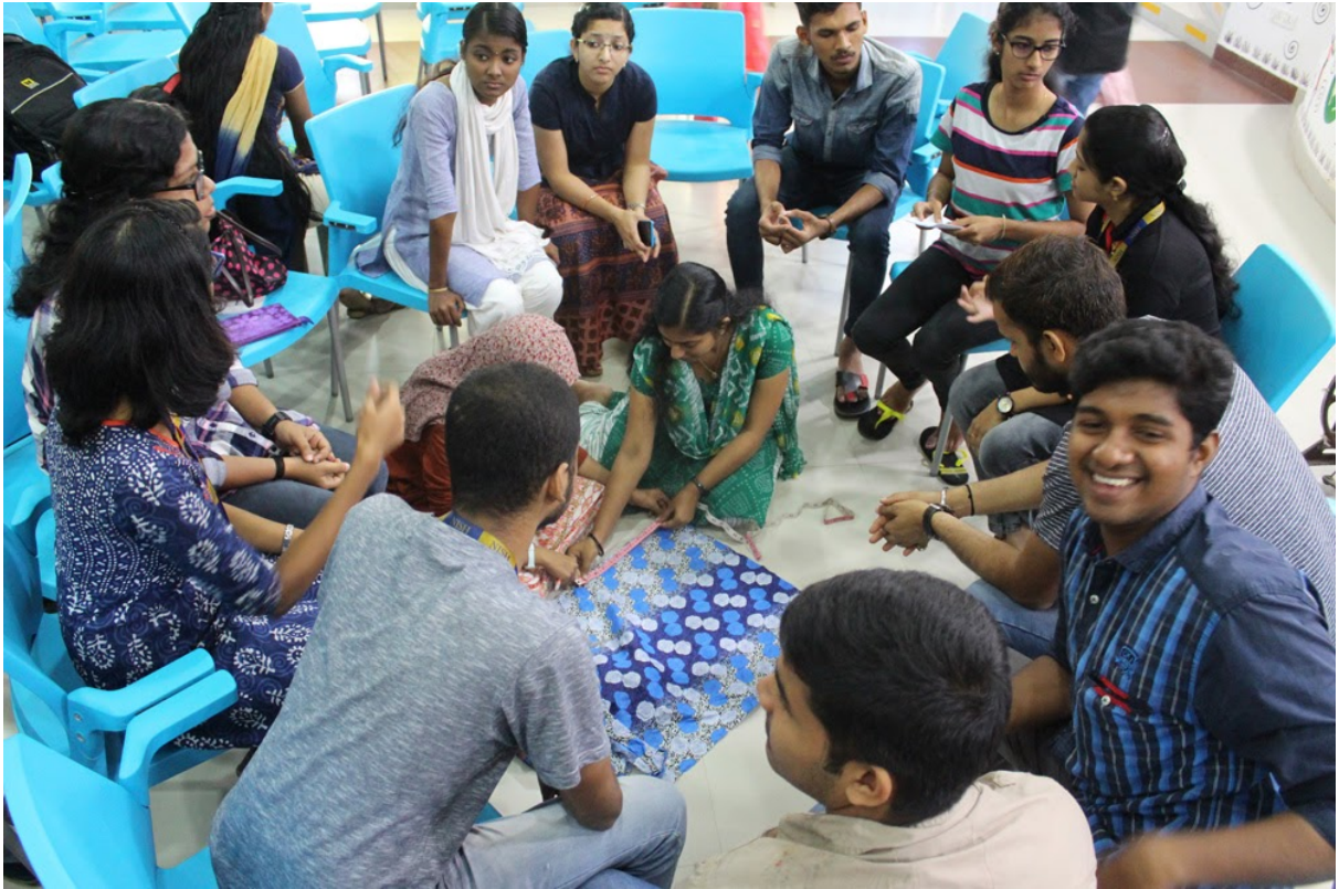
Workshop on Cloth-bag Making Image 1