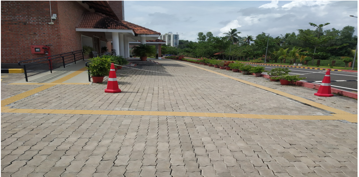
Restricted Entry at Thejus