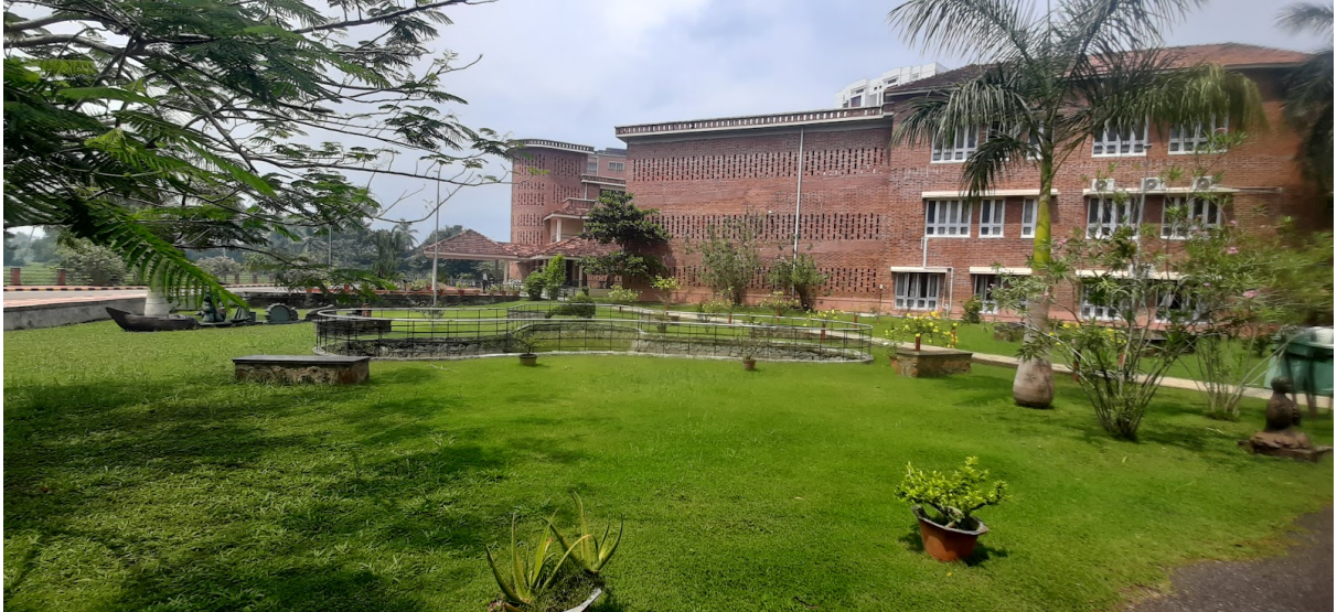
Landscaping Image 3