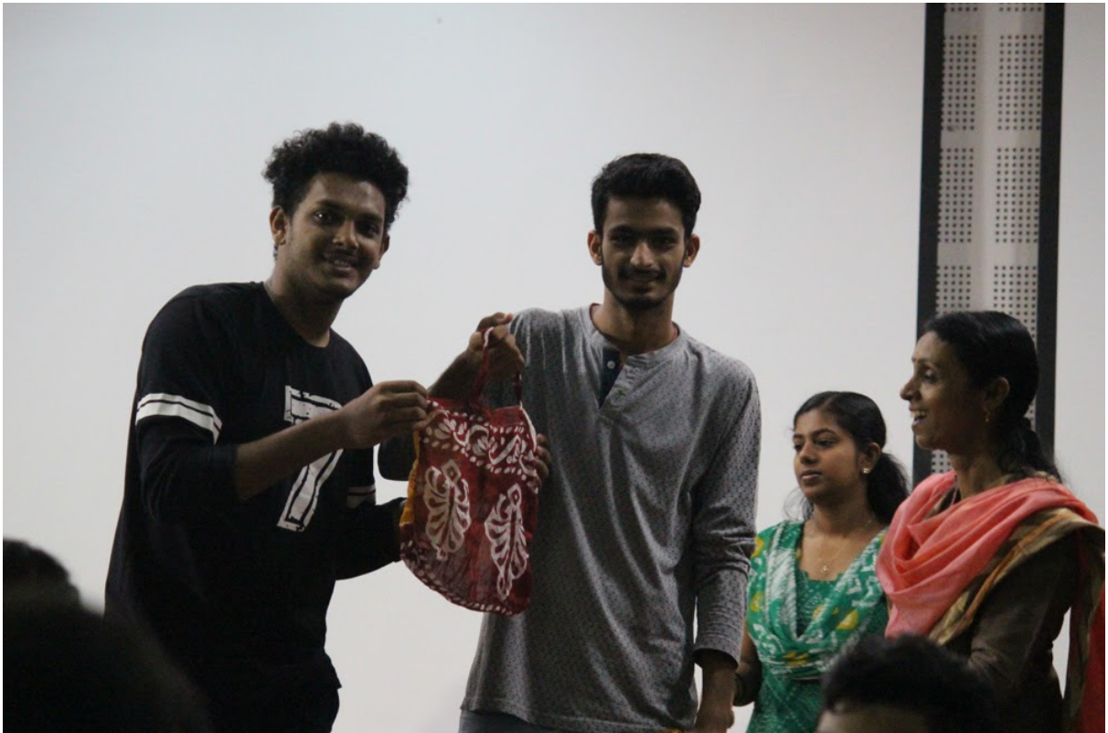
Workshop on Cloth-bag Making Image 6