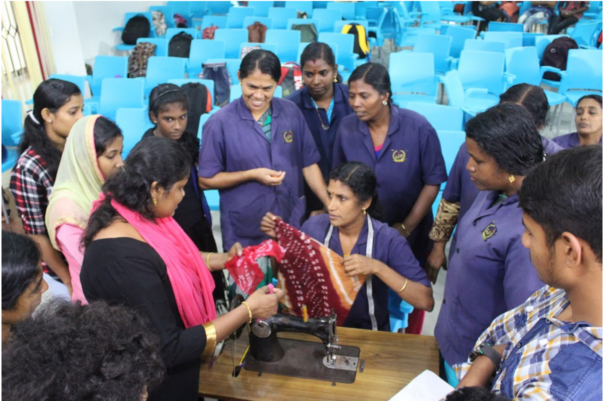
Workshop on Cloth-bag Making Image 5