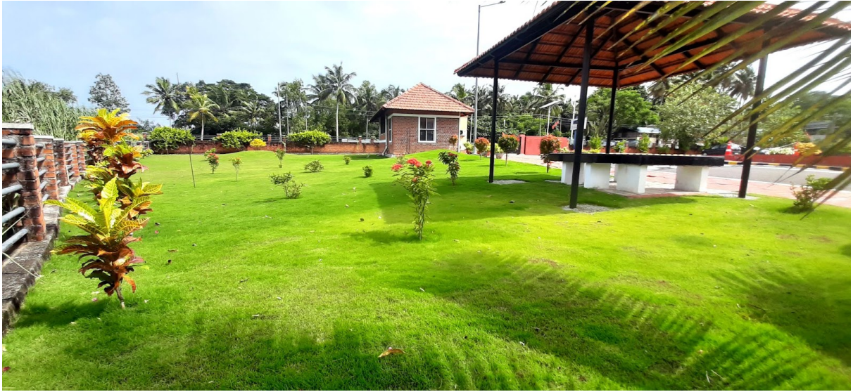
Landscaping Image 1

The campus premises are well maintained with beautiful landscaping, garden, trees, and a pond.