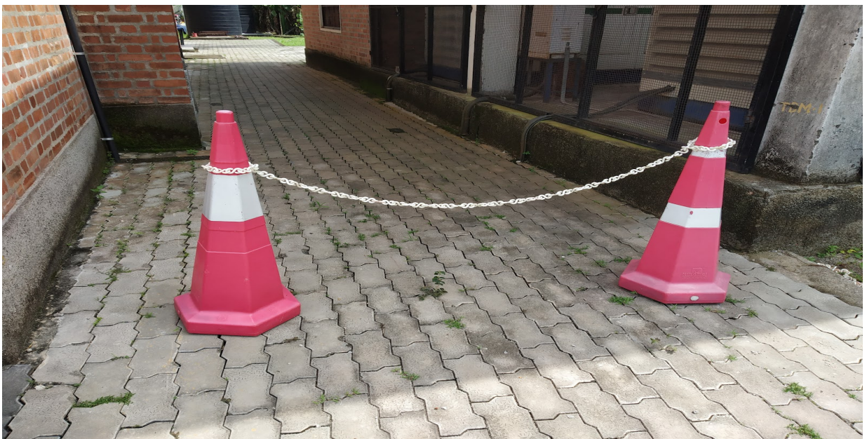
Restricted Entry Image 2