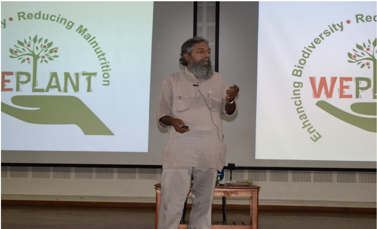
Talk on How to Save Seeds Image 2