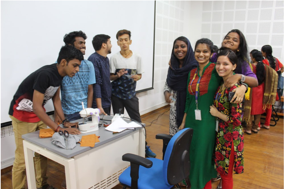
Workshop on Cloth-bag Making Image 3