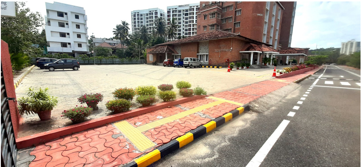
Parking Area at Thejus

Parking NISH only allows passenger vehicles inside the campus ranging from two wheeler to passenger buses. Construction vehicles are allowed only during the time of construction. Also, vehicles are restricted in the area where students, especially who are deaf, are more likely to gather around on campus.