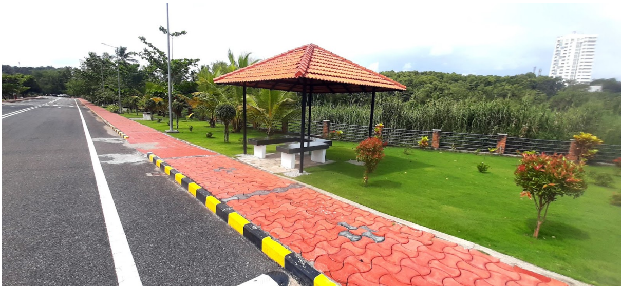
Pedestrian-friendly Pathway Image 2