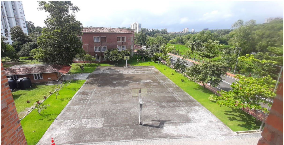
Landscaping Image 2